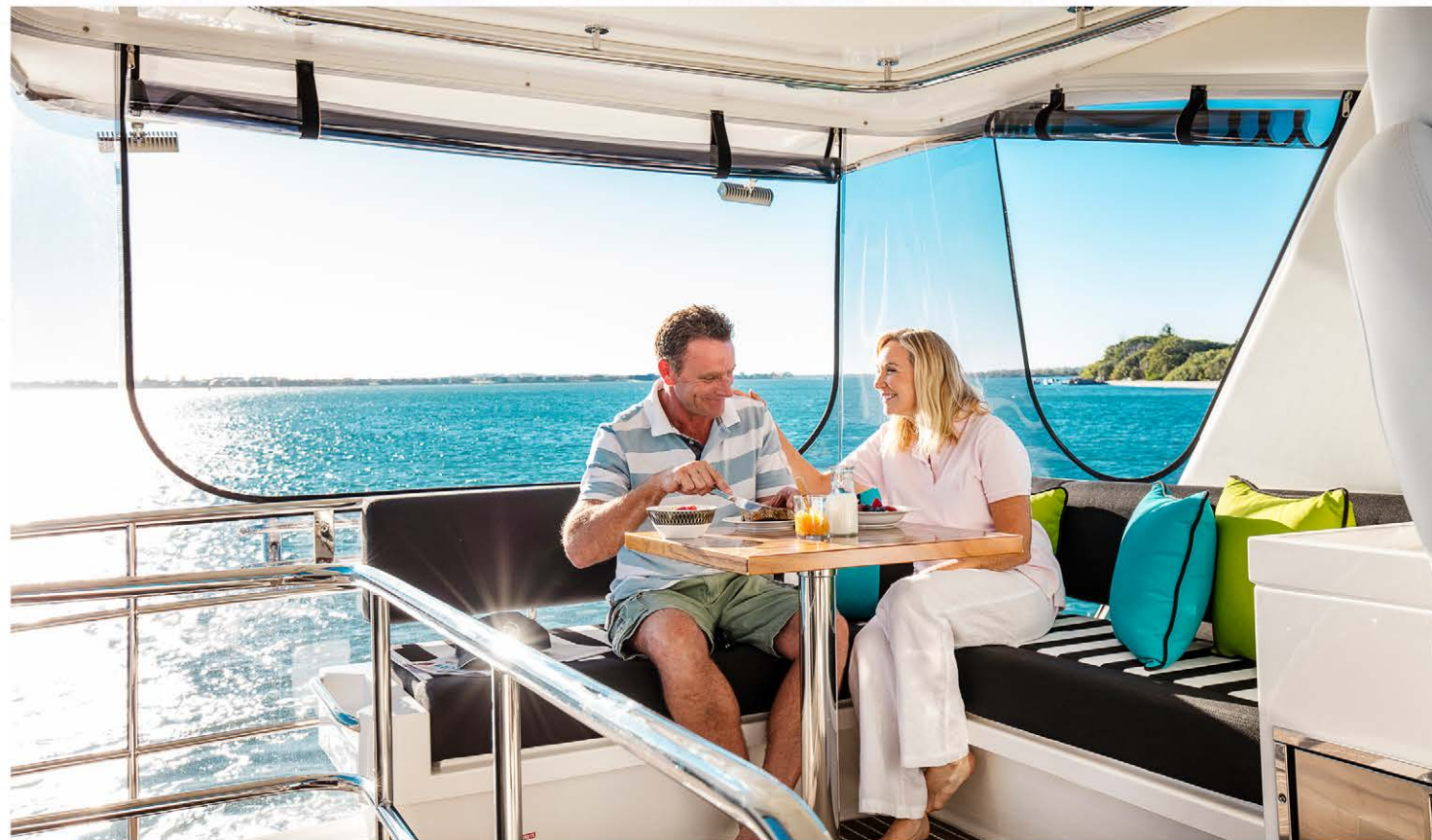
TOP The interior flybridge stairs are clad in satin oak with teak highlights. ABOVE Zippered clears make the flybridge an appealing alfresco dining option.

the ride on this 52 so much I chose to extend my journey right back up the seaway to the Riviera facility at Coomera instead of being dropped off at a more convenient Runaway Bay. The layout and comfort levels simply promote great times.