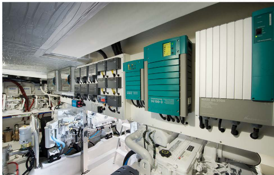
TOP Admirable range comes via 3500L of fuel, so extended offshore missions are no problem. ABOVE Twin Volvo Penta D11s are matched to IPS20 pod-drives in the well-appointed engine space.

“There’s nothing quite like the wind in your hair with the throttles down.”