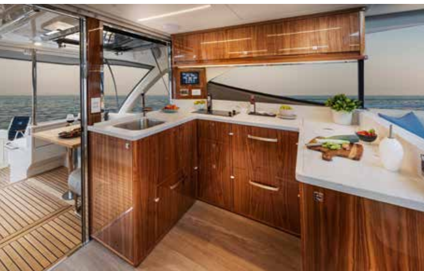
Below: The big aft galley is ready to cater outside through a lift-up servery window.

storage options including underfloor self-draining wet boxes. There's immediate access to the spacious engine room via a large floor hatch in the mezzanine, and serviceability of the pod drives via the lift-out wet boxes. The cockpit also features a large barbecue/wet bar centre and 130lt top-loading fridge/icemaker compartment.