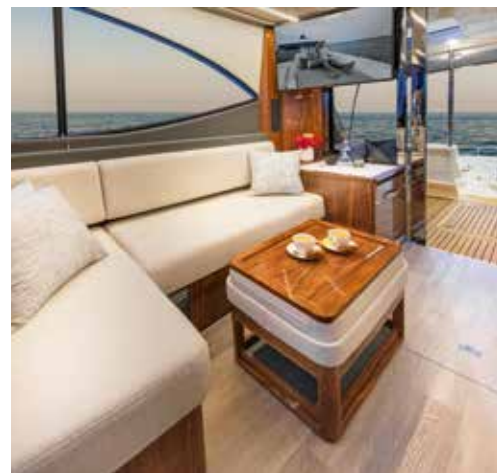
Right: Saloon's starboard lounge has an ottoman that doubles as a coffee table.

The master invites you to relax in ultimate comfort provided by the queen-size berth, chaise longue and bureau. There are full-length dressing mirrors either side of the bed and flooding natural light from large hull windows complete with opening portholes. You'll also love the water-level views and feel safe in knowing that the glass is 26mm thick – the same as the hull. The en suite, with full-size shower, vanity and marine head, is light, roomy and well-appointed.