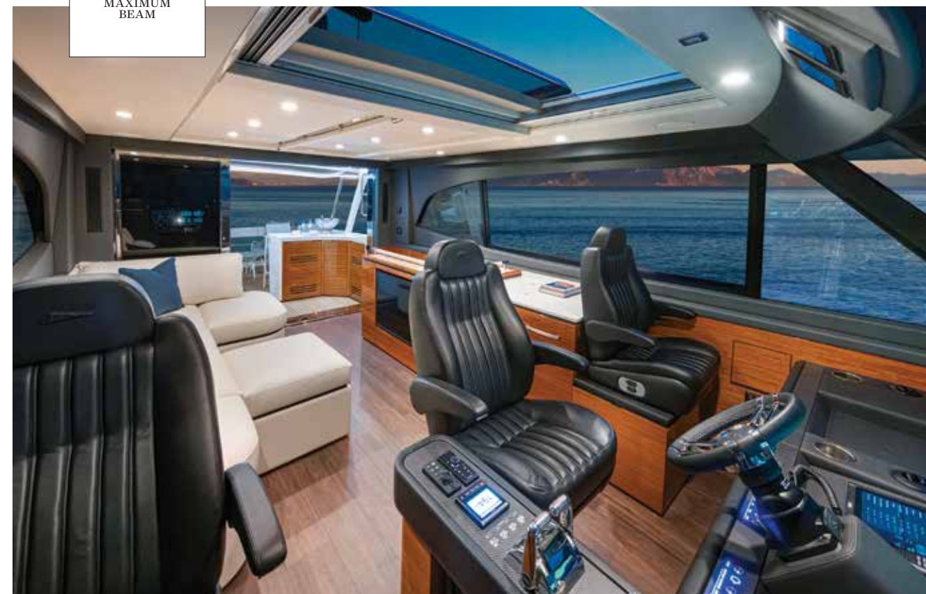
The full-beam master stateroom (top) is amidships. The helm has an extended platform that keeps the throttles within arm's reach.