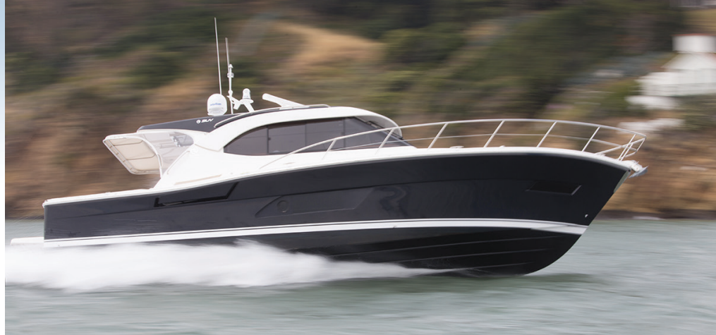
This boat handles as well as she looks passing the camera boat with a wide open throttle at nearly 34 knots.

With the camera boat a few hundred feet south of the light-house, we set up and made several high speed passes at our wide open speed of nearly 34 knots. The water in the area was quite choppy, but the 445 sliced through the four-foot chop as the Volvo's climbed easily to WOT. I quickly tired of trying to upset the SUV's composure with hard left and hard right turns, quick acceleration, and digging into beam seas so we headed across Hurricane Gulch to Angel Island. We found exactly the conditions I was hoping for there on the cool summer afternoon in San Francisco Bay with twenty-five knot winds and a strong ebb – rough! Adding a few ferry wakes in the mix, we had four- to five-foot short steep waves directly on the bow that would have made a lesser yacht turn around for home with her rudder between her chines. However, not us, we just went faster, and with a bit of effort we finally got some spray on the windshields and needed to acti-