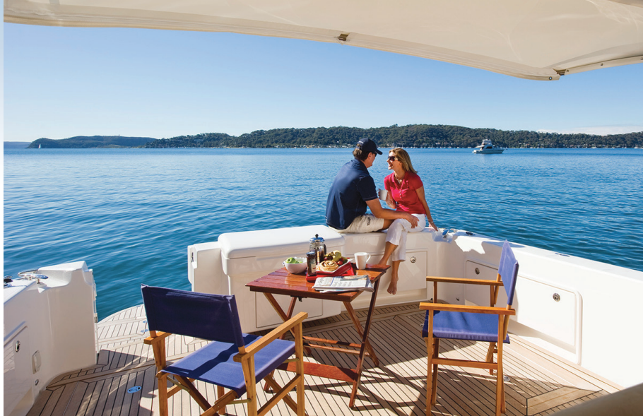
With plenty of room for deck chairs and alfresco dining, the cockpit is as inviting as it is usable, and a perfect spot to watch the sunset with a glass of port and a fine cigar.

Like the competition in this yacht class, the 445 offers a wide, almost fully enclosed cockpit that