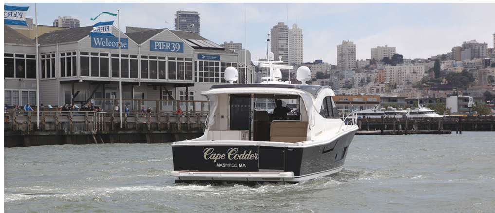
Entering the breakwater at the west basin of Pier 39, high winds and white caps followed us all the way in.