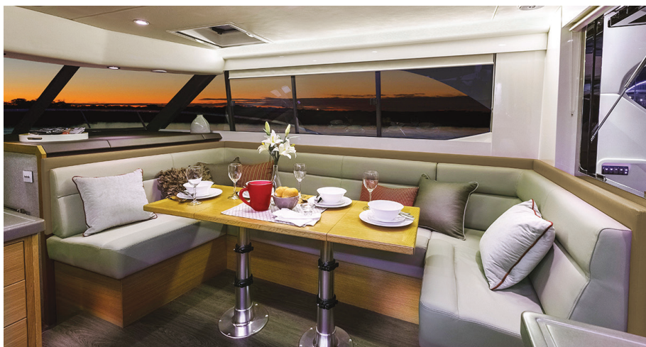
The combined galley/saloon make for a large dining and food prep area with plenty of seating room for five. The U-shaped seating converts to a double berth should added guests want to stay over.

connects through a polished, stainless steel framed sliding door into the large saloon with the galley