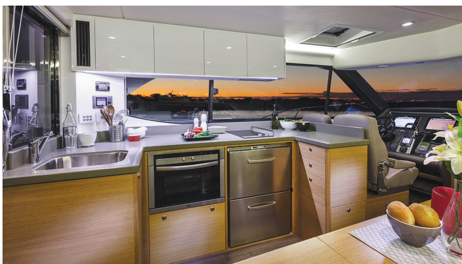
A modern, efficient galley with all of the expected appliances – convection microwave, drawer refrigerator/freezer, electric cooktop, stainless steel basin, and tons of overhead cabinet space.

to port, generous table seating to starboard, and the helm forward to port. Lock the slider open, and lift the gas cylinder assisted awning window, and the cockpit becomes part of the saloon.