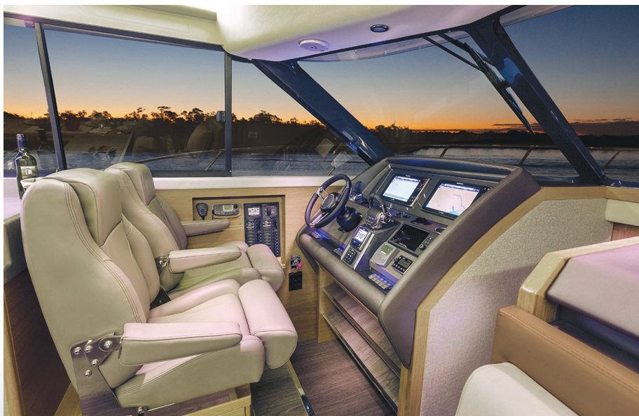
Kudos to the designers of the 445 helm – clean lines, switches and controls intuitively placed, and integrated Garmin glass bridge with Volvo IPS control.

private in-suite head, compete with porcelain fixtures and separate shower, round out the large master stateroom.