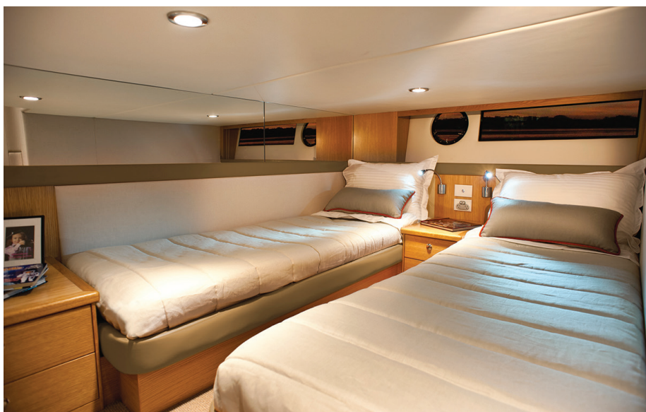
More surprises with the three single berths – access to the day head via a private entrance, and lots of storage.