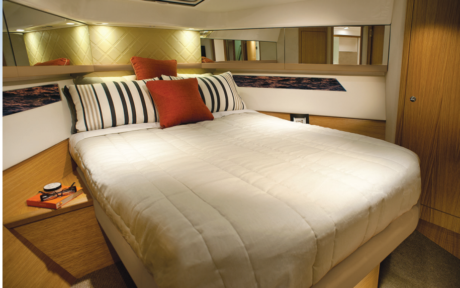
Master stateroom has a centerline queen with storage underneath, two portlights, overhead hatch, hanging lockers, a private head with shower, all with incredible space for a 44-foot boat.

Forward and down the companionway are the sleeping quarters. The master stateroom is forward most with an easily accessed centerline queen berth with storage drawers underneath. For ventilation there is an overhead hatch and long in-hull windows along each side. One big surprise is the headroom in this stateroom, enough for a six-footer to stand tall and not muss up the hair. Two hanging lockers, recessed LED lighting, and