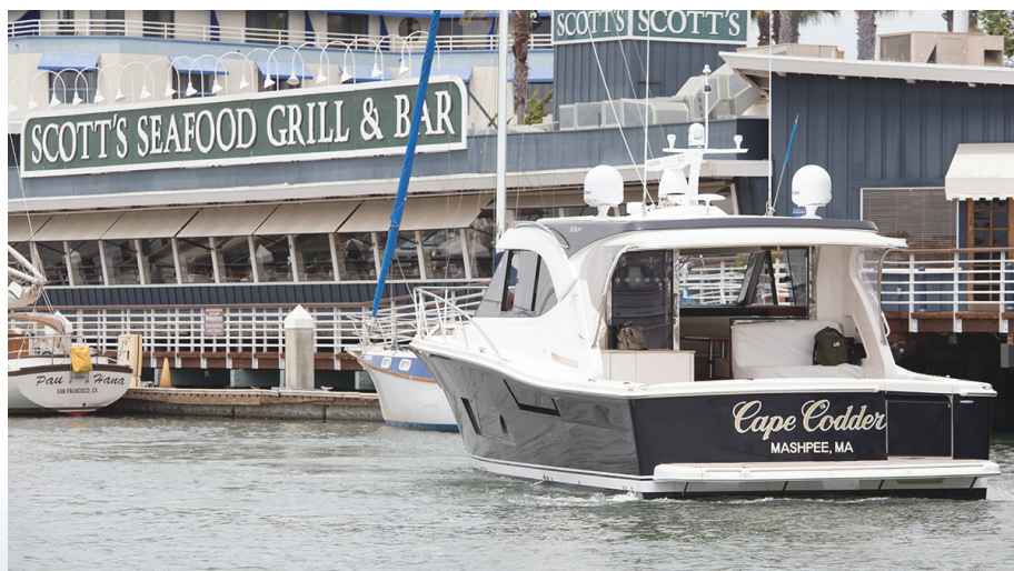
With the Volvo Dynamic Positioning System in the crowded harbor at Scotts, Jack London Square, we could effortlessly wait all day for dock space to open up.

Prior to our sea trial and day of thrashing the SUV around the bay she had been sold. Thanks to the new owners they allowed us use the boat for this article and were along for the ride around San Francisco Bay. Having put some five hours additional ticks on the clocks, the