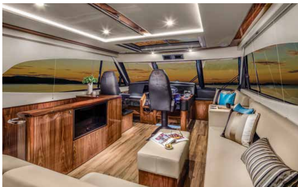
Above: A perfect dawn on the morning of our review heralded wonderful things to come ....

the vessel impresses with its performance and sophistication