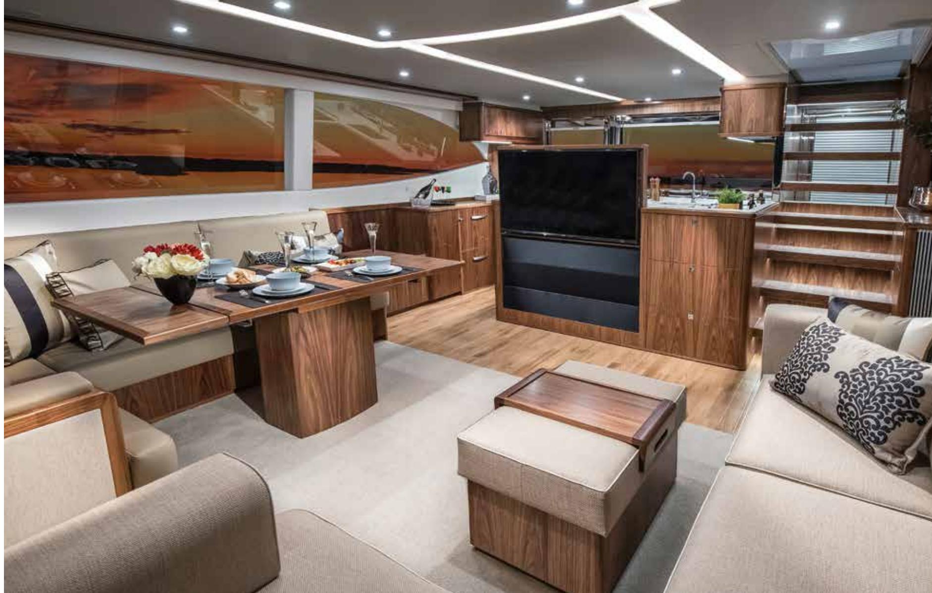
Right: Elegant, spacious living in the palatial saloon.